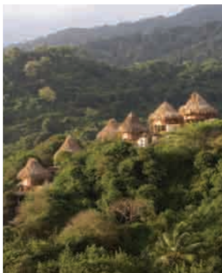
Ecohabs, Tayrona National Park

Your guide will pick you up today for an all day private visit to a typical village of Filandia, famous for its 'antioqueño' architecture as well as for basket weaving. Continue to the beautiful Valle del Cocora (Nevados National Park) where on a short walk you can admire the 60m high palm trees. Numerous bird species inhabit the area and roads are lined with brightly-coloured 'finca's, typical coffee growing farm houses built with local wood, tiled roofs and mud walls. Transfer to Pereira for a two-night stay. (B)