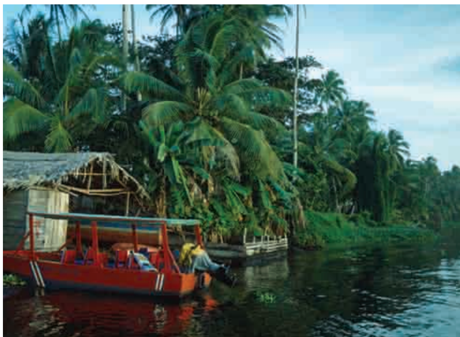
The canals of Tortuguero