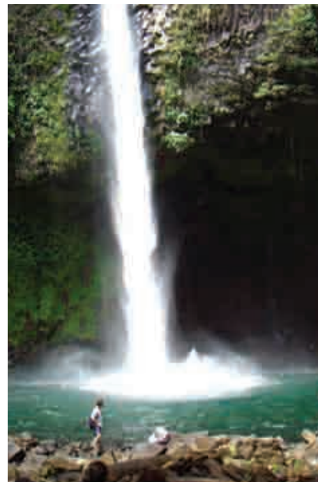
La Fortuna Waterfall

Early in the morning, participate in a walking tour of the forest and try to find one of the most beautiful birds of the cloud forest, the quetzal. Free afternoon to enjoy the area's beautiful scenery or take optional excursions. (B)