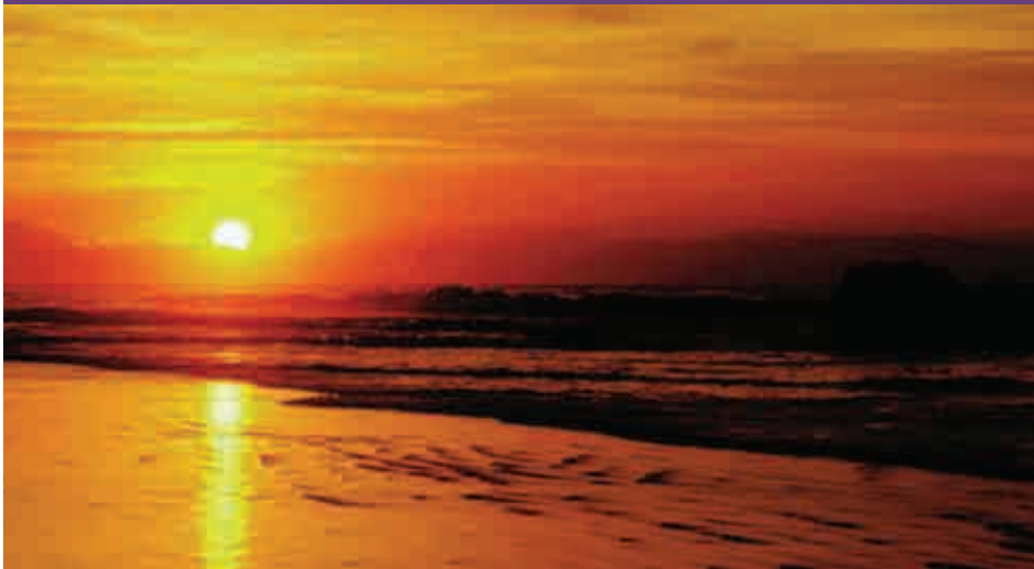
Pacific Coast sunset

The Pacific coastline of Costa Rica is rugged and beautiful, and there are opportunities to explore the coastal rainforest as well as relax on the quiet beaches, ranging from volcanic black to tropical white sands. The beaches offer everything from tranquil escapes in small boutique hotels to active holidays in full-service resorts, either way these hotels make excellent extensions to our Costa Rica tours.